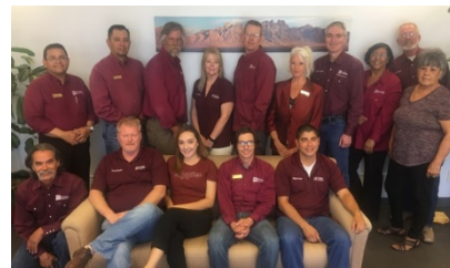
NMSU's Research Safety, Environmental Health Safety and Risk Management team

With access to on-campus NMSU laboratories, work spaces and offices limited to faculty and staff who provide essential/critical functions, Environmental Health, Safety and Risk Management (EHS&RM) has prepared an easy-to-use Laboratory Ramp-Down Checklist. The checklist is general enough that it also can be useful for other work spaces such as shops, maker-space studios and support areas. The checklist and other COVID-19 resources are available on the Research and Laboratory Safety Page.